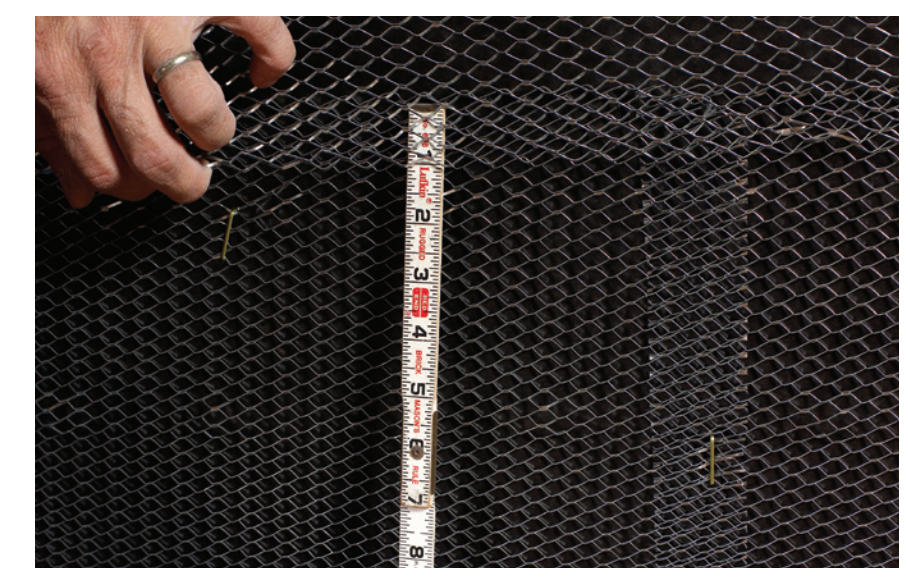
Overlap vertical and horizontal seams.