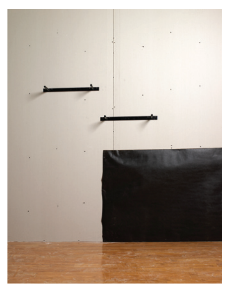
Install weather-resistive barrier.