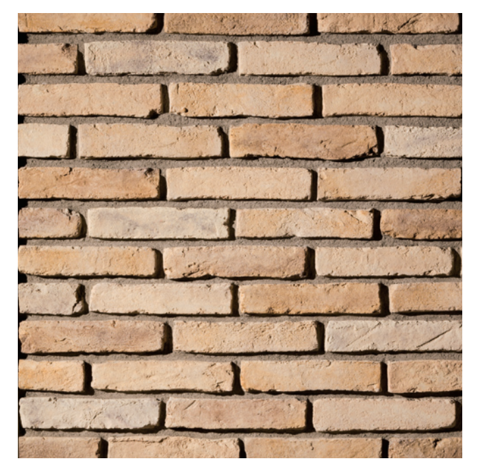
CASTELLO RomaBrick with a Standard grout technique. A Standard grout technique creates a look much different than the other two techniques above.