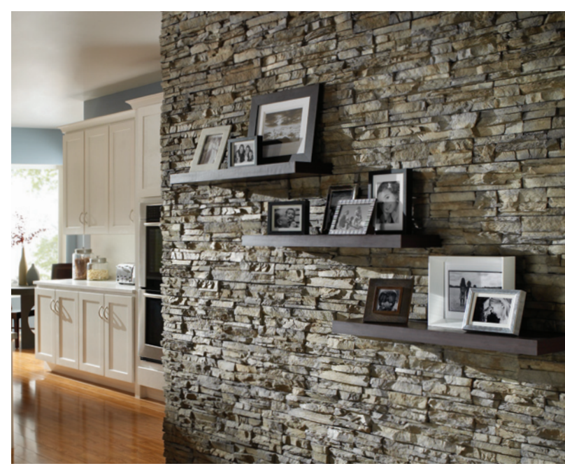
This ArtWall employs a Dry-Stack grout technique which requires no surface grouting.

Each piece is laid 0.5" apart. The grout should overlap the face of the veneer, widening the joints and making them very irregular. (See page 4.)