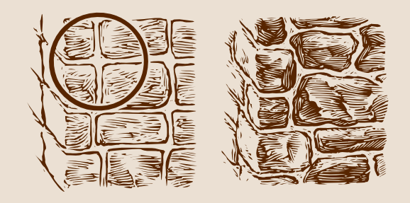
CAREFUL! Avoid the awkward "+ sign" pattern (left) that can occur if installed incorrectly. Locate the individual stones so the grout joints are staggered (right).

Depending on the profile selected, chalk lines may be desired to grid the wall and keep the joints straight. Lay out a minimum of 25 sq. ft. of veneer on the floor to ensure a selection of random color hues and a variety of shapes are selected for installation.