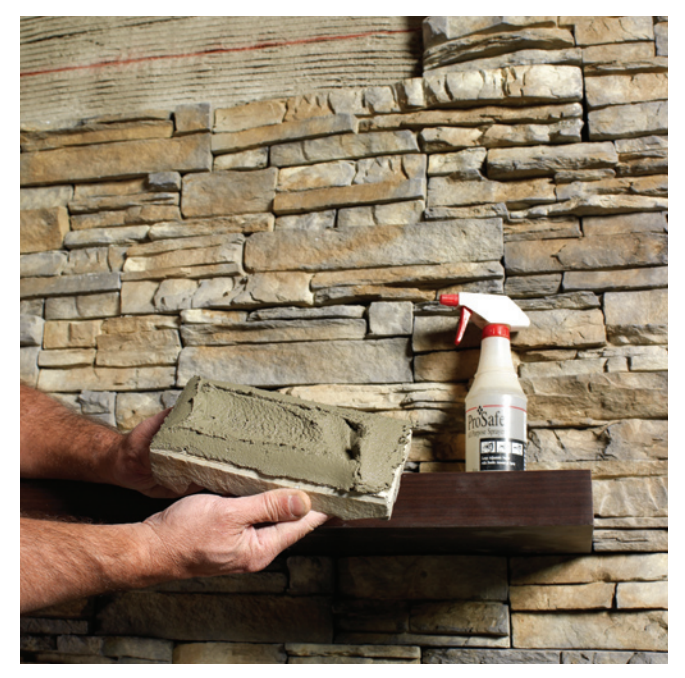
Top: Grid the wall with chalk lines. Above: Apply mortar to back of stone. Above right: Keeping the stone level, wiggle into place.