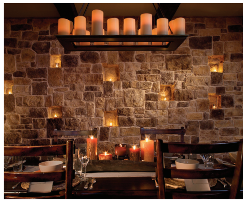
This other Gemstone Wall — Eldorado's CandleWall — uses an Overgrout technique.