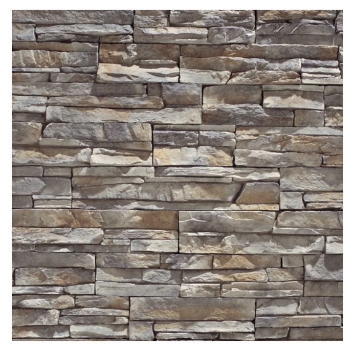
NANTUCKET Stacked Stone with a Dry-Stack grout technique was specified for the ArtWall represented in this Idea Book.