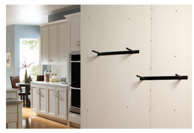
Placement of the shelving brackets and shelves prior to stone installation so shelves appear recessed within the stone upon completion of ArtWall.