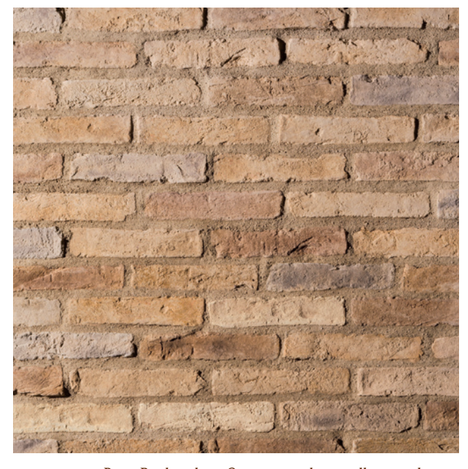
CASTELLO RomaBrick with an Overgrout technique illustrates how rustic and old-world the face appears when Overgrout is installed.