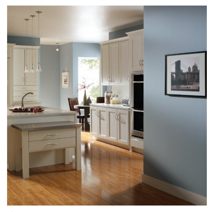
The kitchen wall before its transformation into the Eldorado Stone ArtWall.