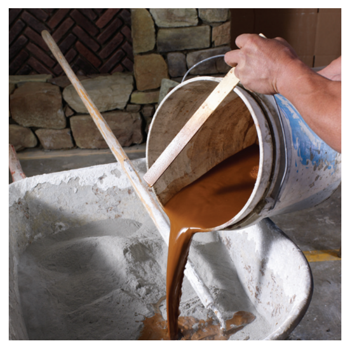
Above: Eldorado Stone recommends adding color to the mortar. Below: Even though Eldorado Brick is being grouted in this picture, the theory is comparable when for grouting Eldorado Stone.

Eldorado highly recommends that multiple tests are done with some loose stones on a board before commencing grouting the actual wall.