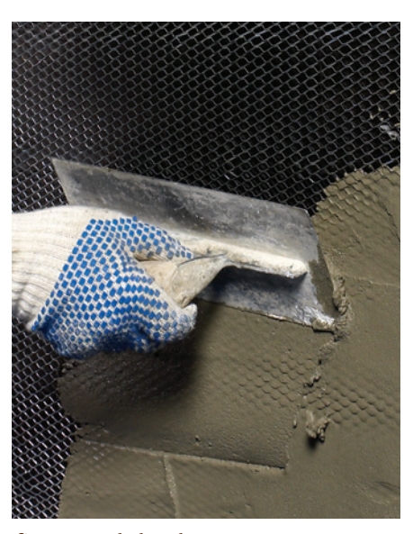
Cover entire lath with mortar.